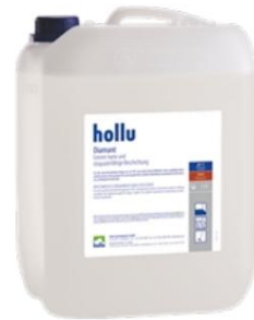
Item No. g0680 canister 10 L