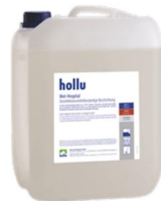
Item No. g0660 canister 10 L