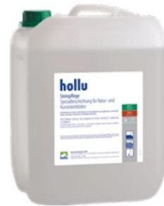
Item No. g0640 canister 10 L